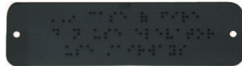
MIS-166E-B Braille Fire Sign